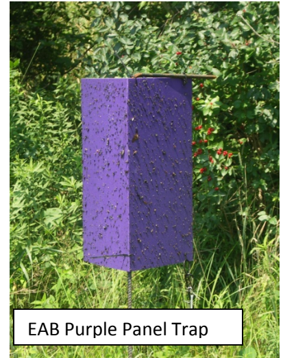
EAB Purple Panel Trap

No, the traps will not bring EAB into an area that is not already infested.